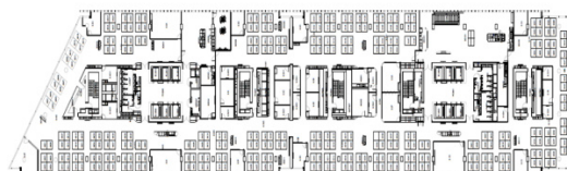
PLAN - 9 th Floor - Campus 6.2 building & Campus 6.3 building